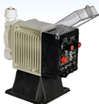
TJ-MD 8 / 12