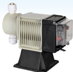
TJ-MD 20 / 40 / 100